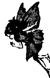
Midsummer Night's Dream at Powell Symphony Hall

Our address is: Alexandra Ballet, 68 Four Seasons Center, Chesterfield, Missouri 63017